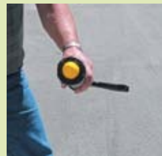
Attach the end cap and cone tip to the end of the barrel