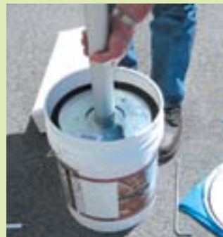
Remove the cap and cone tip from the gun barrel and push the end of the barrel onto the hole