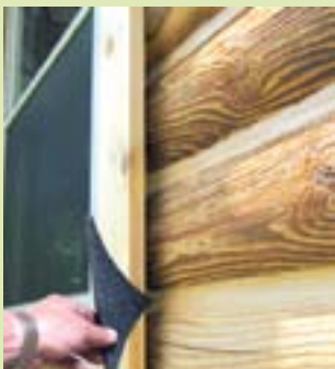
Use Log Gap Cap™ where round logs meet window and door jamb trim