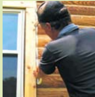
Apply masking tape to prevent sealant from smearing onto the adjacent logs