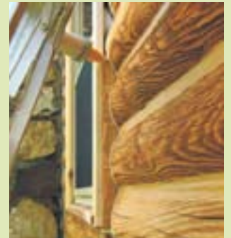
Fill the 3/8" gap between the surface of the foam and the edge of the frame with sealant