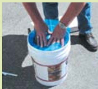
Replace plastic liner over the surface of the sealant