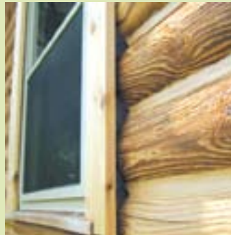
Insert Log Gap Cap™ into void between logs and frame. Leave 3/8" gap between surface of foam and edge of frame