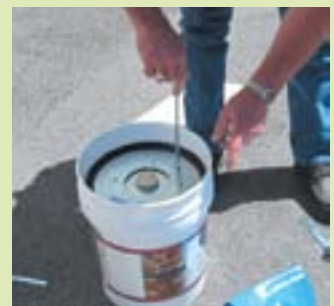
Insert the handle rod into the open nut to remove the follow plate