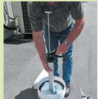
Ensure the tight seal, fully extend rod and fill the barrel. Disengage from the follow plate