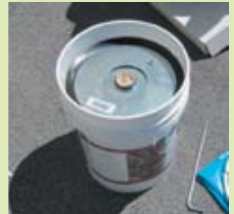
Place the follow plate on top of the chinking pail