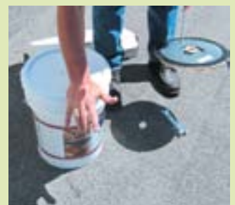
Replace the lid. Make sure that it is tight on the pail