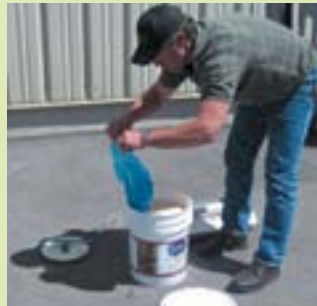
Remove the lid and the plastic liner from the pail